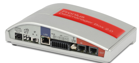
/ Fronius Datamanager Box 2.0